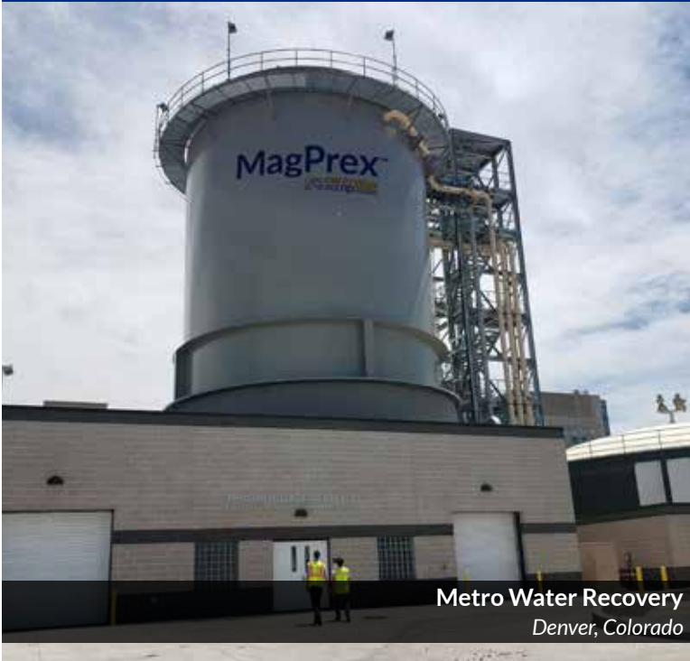
Metro Water Recovery Denver, Colorado