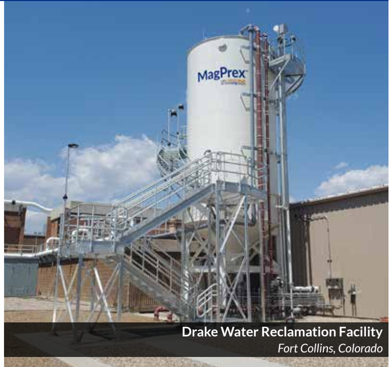
Drake Water Reclamation Facility Fort Collins, Colorado