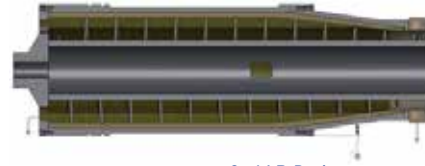
3 : 1 LD Ratio

The "L/D ratio" is the overall internal bowl length divided by the bowl inside diameter in the cylinder.