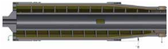
4 : 1 LD Ratio